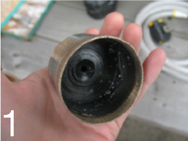
Use a high quality diamond coring bit

If glass is not drilled properly it can and will easily chip or break. Here is a guide on how to successfully cut glass