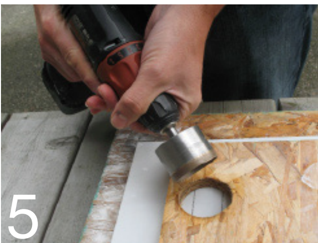
Drill on a stable surface