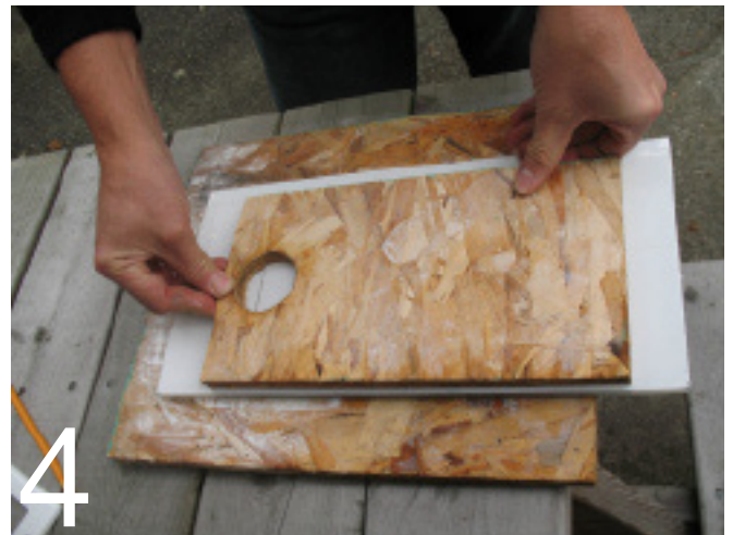
Use a wooden pattern to guide the coring bit