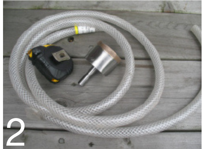
Use plenty of water for lubrication