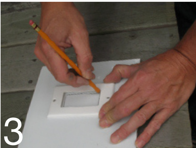
Mark the area you will be drilling through